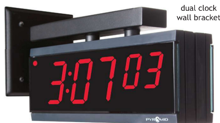
Part# 42320 for 4x6 digital clock