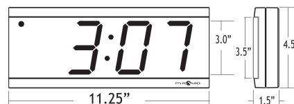
3" x 4 Digit Series