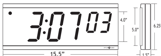
4" x 6 Digit Series