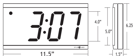
4" x 4 Digit Series