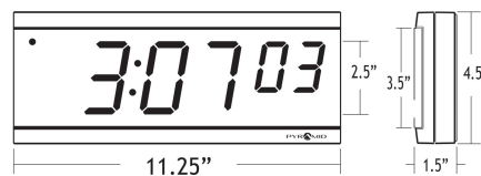
2.5" x 6 Digit Series